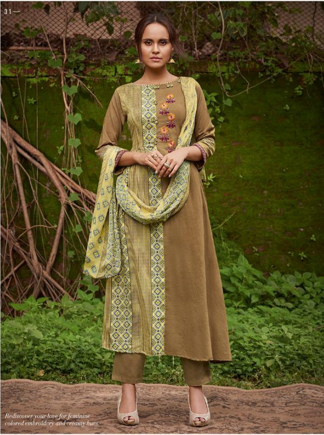
Rediscover your love for feminine colored embroidery and creamy hues.