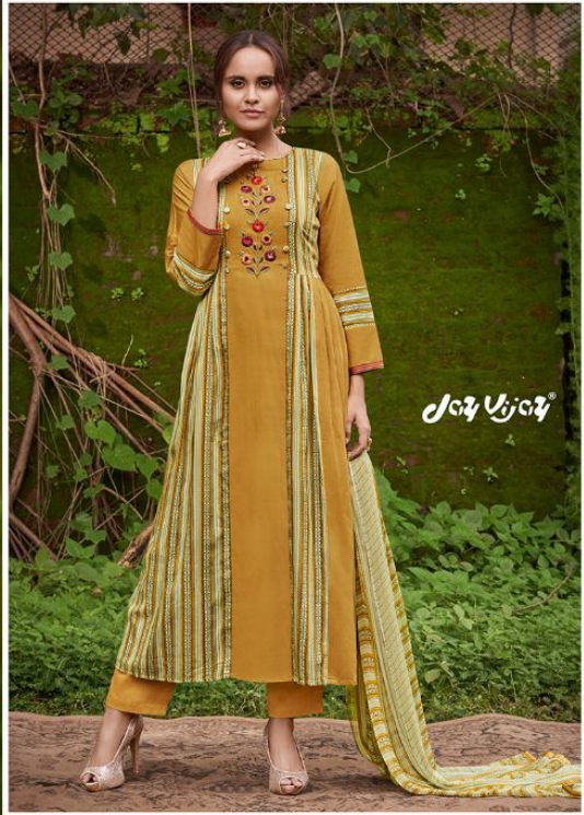
Reclaim a subtle understated elegance as your signature style. GULNAAZ | STYLE: 4223