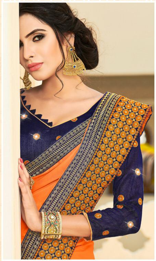
FESTIVITY IS IN THE AIR! ENJOY DIVINE'S ETHNIC MONTIS AND RANGOLI COLOR. PALETTE THE MODERN WAY 96004