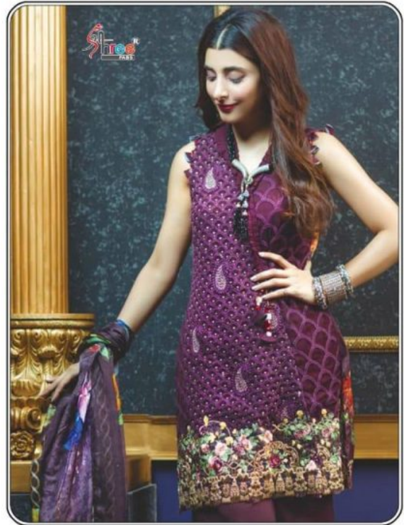
RANG RASIYA Premium Collection