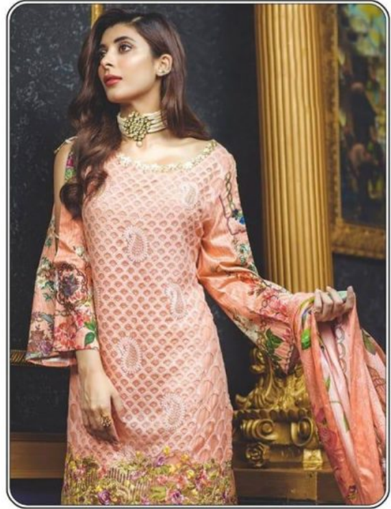
RANG RASIYA Premium Collection