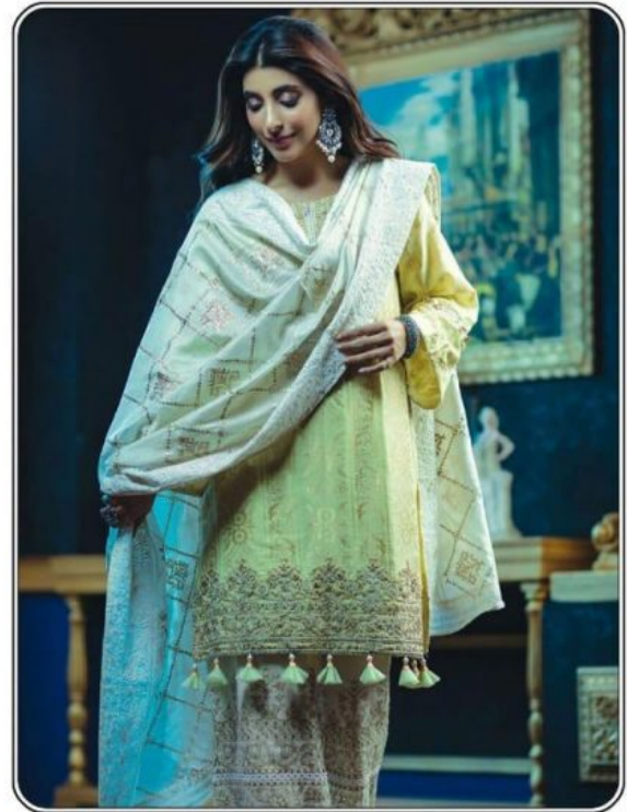
RANG RASIYA Premium Collection