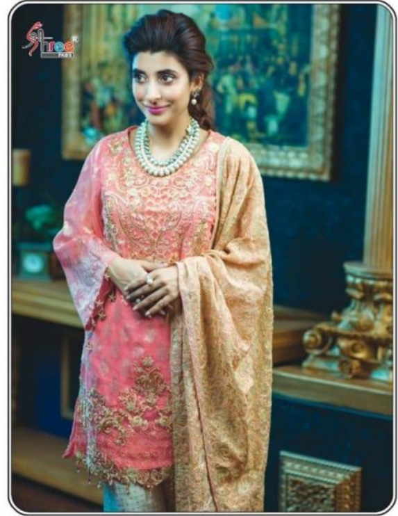
RANG RASIYA Premium Collection