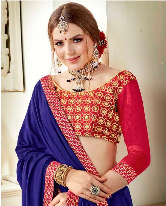
Brighten up yourself with an array of Florals in cool blue and Red on soft surface that will take you through the season in style.