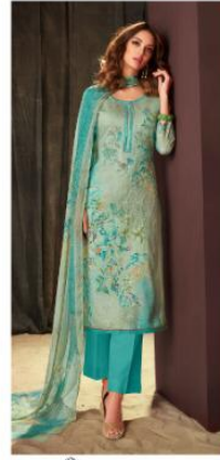
STYLE No. 53007