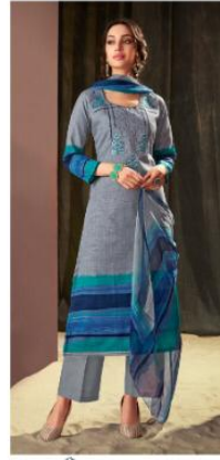
STYLE No. 53006