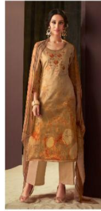
STYLE No. 53008