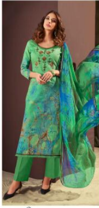
STYLE No. 53002