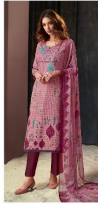
STYLE No. 53005