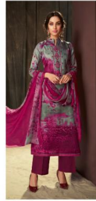
STYLE No. 53009