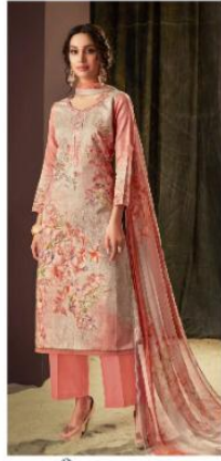
STYLE No. 53003