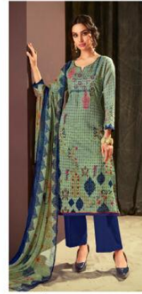
STYLE No. 53010