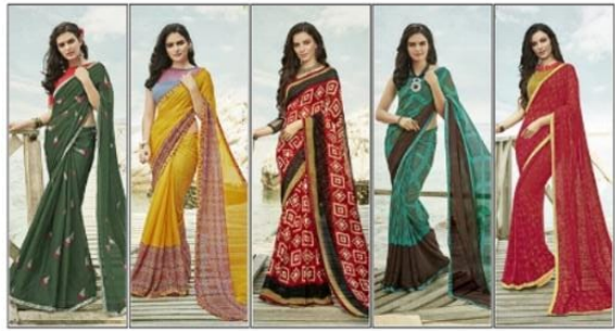
D.no-1184 D.no-1185 D.no-1186 D.no-1187 D.no-1188