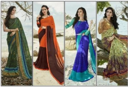
D.no-1176 D.no-1177 D.no-1178 D.no-1179