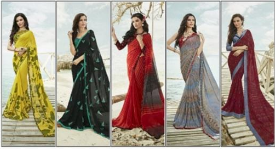
D.no-1171 D.no-1172 D.no-1173 D.no-1174 D.no-1175