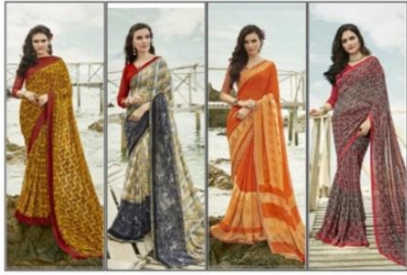
D.no-1180 D.no-1181 D.no-1182 D.no-1183