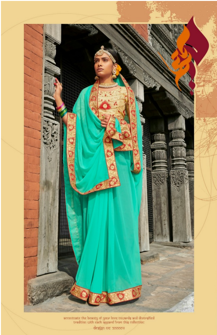
accentuate the beauty of your love towards well diversified tradition with each apparel from the collection. शेखर एन. सोनोव