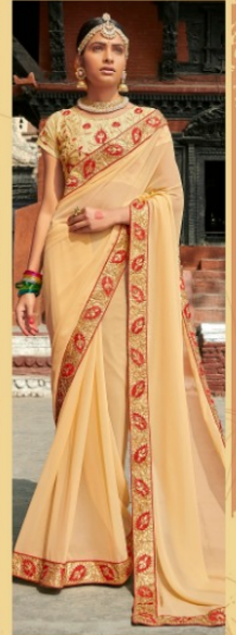
design no. 200006