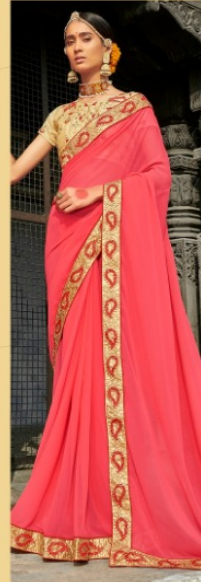
design no. 200005