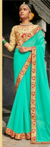
design no. 200004