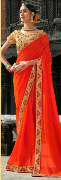
design no. 200003