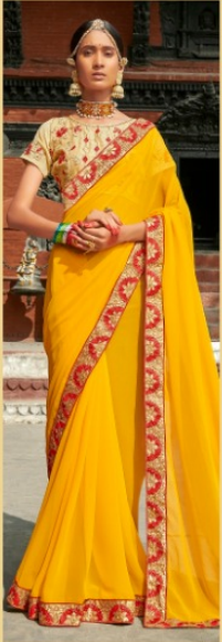
design no. 200001