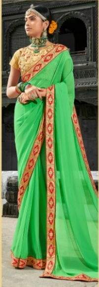
design no. 200002