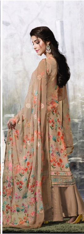
2006 MATCHLESS STYLE, AMAZING WORK DETAILS AND A DASH OF TRADITION