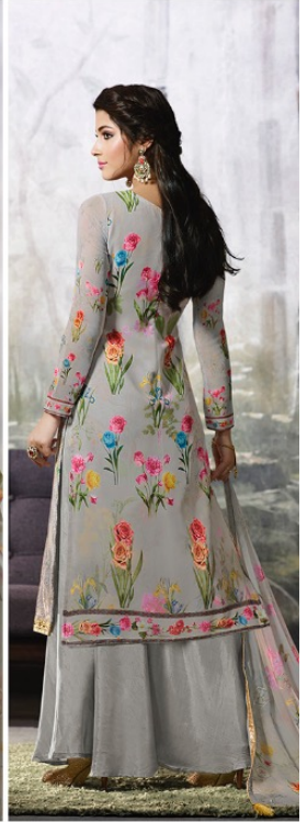
2002 EVOKE YOUR ETHNIC ETHOS WITH THIS BEAUTIFULLY CRAFTED DRESS