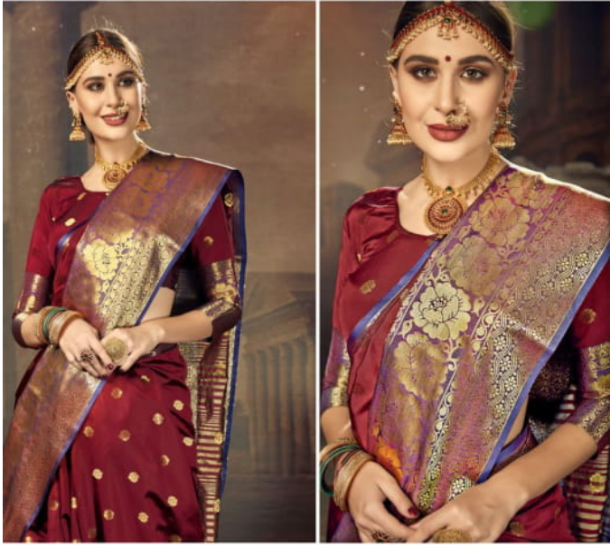
WHEN YOU EXPRESS IT YOU EXPRESS YOURSELF. A DRESS IS AN EXPRESSION OF YOUR PERSONA.