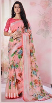
D.NO. - 9701