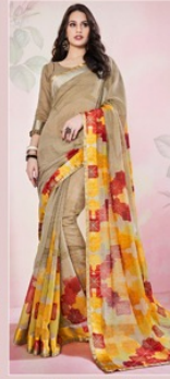
D.NO. - 9705