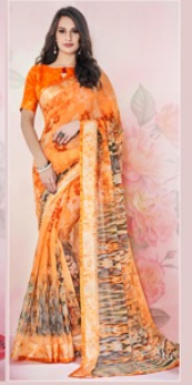
D.NO. - 9707