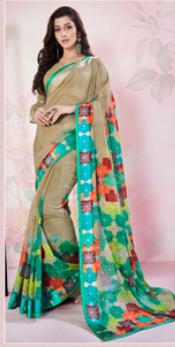
D.NO. - 9702