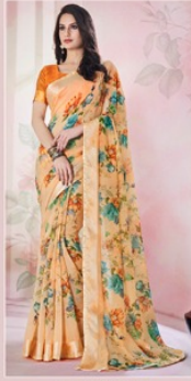
D.NO. - 9703