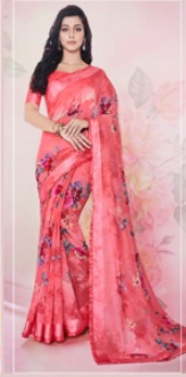
D.NO. - 9706