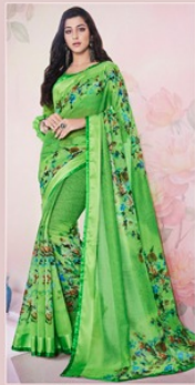
D.NO. - 9708