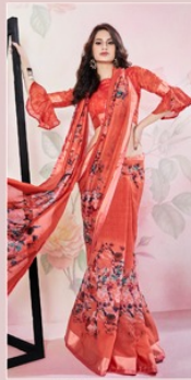
D.NO. - 9709