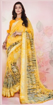
D.NO. - 9710