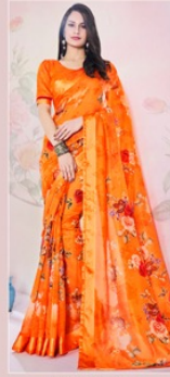
D.NO. - 9704