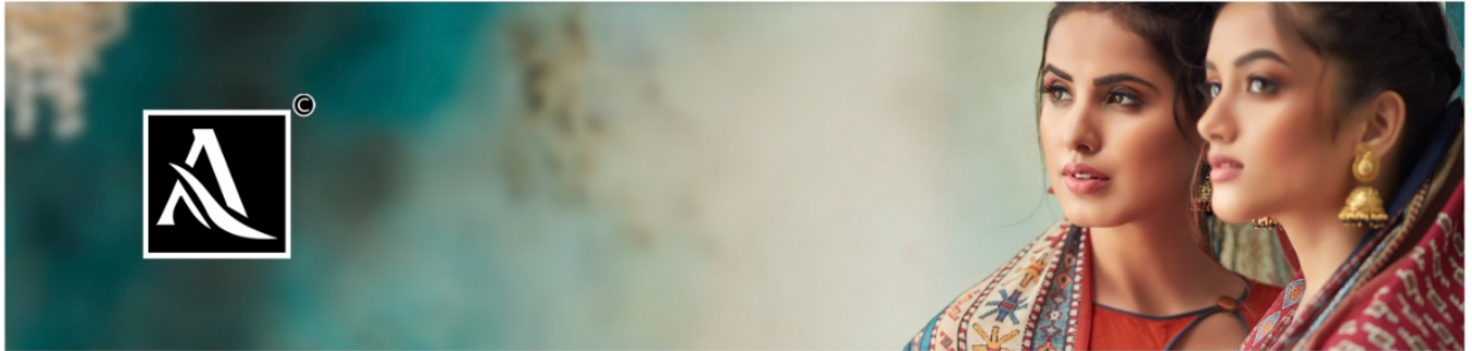
D.No. 355-004 🌿