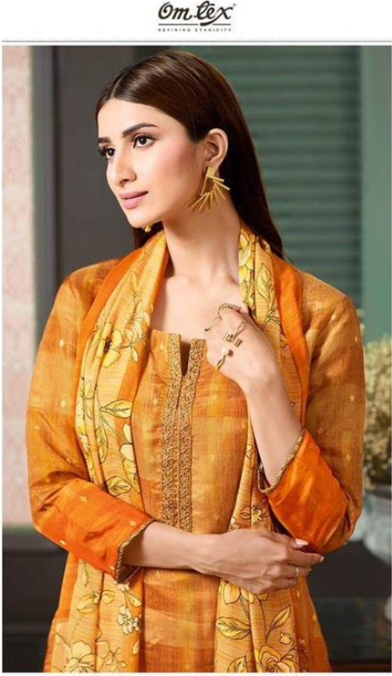
+ 646 +