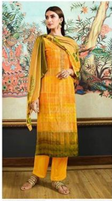
+ 643 +