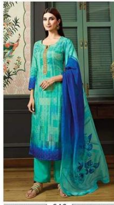
+ 642 +