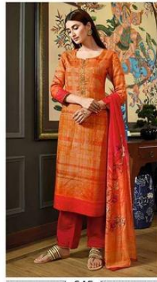
+ 645 +