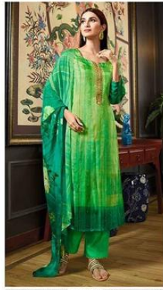
+ 642 +