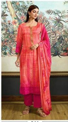
+ 641 +