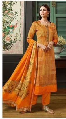
+ 646 +