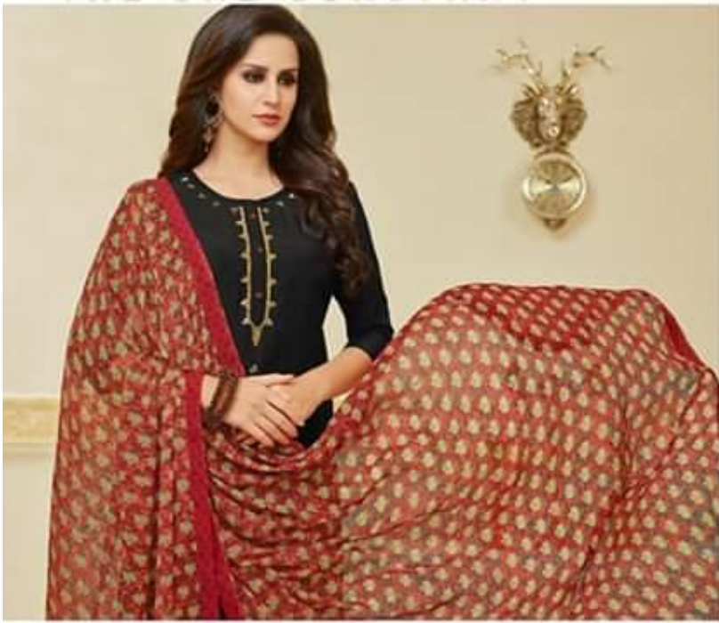
From the fast forward to current trend report, the one constant factor is the infusion of ethnic and regional flavour.