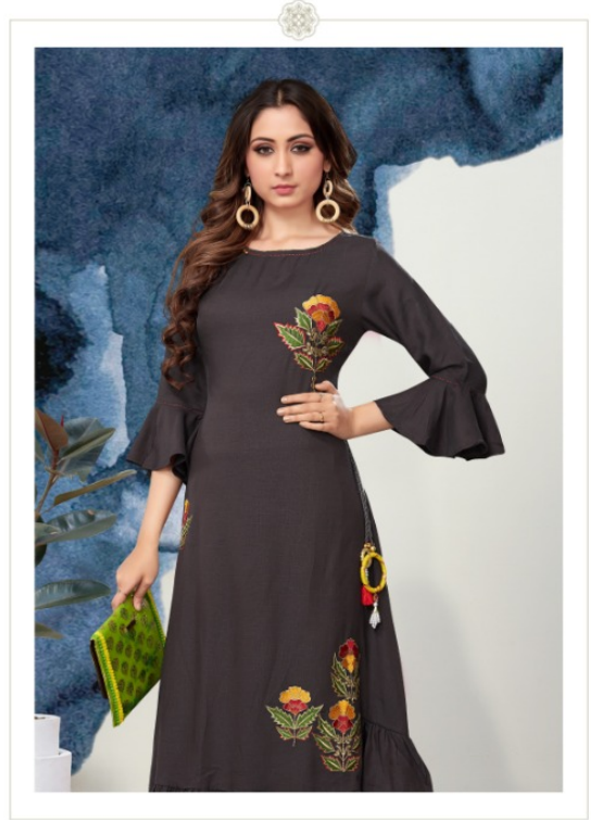
Classic elegance is the balance between proportion emotion and surprise we make clothes women make fashion