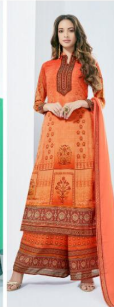
◆ D.No.8606 ◆