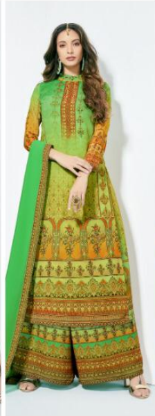
◆ D.No.8602 ◆