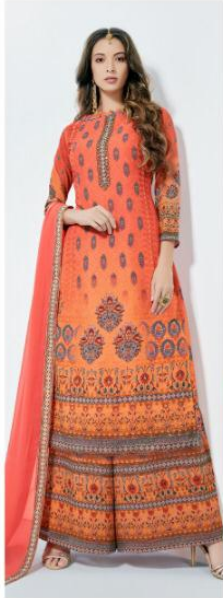
◆ D.No.8601 ◆