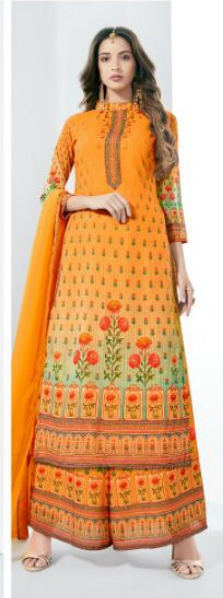
◆ D.No.8603 ◆