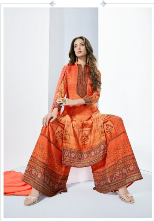
Every night men dream of a stream of pure, clear clarity, it is picture perfect in every way and wells up sheer ecstasy in every heart.