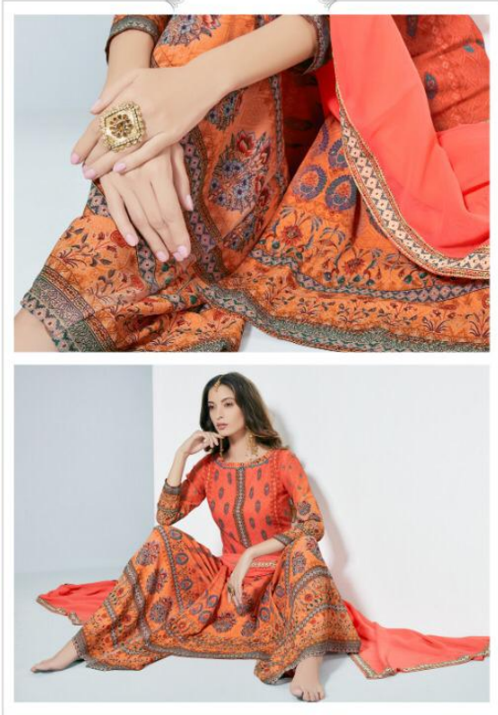
You a collection designed with I dress for the image, not for myself, not for the public, not for fashion, not for men. Fashion is stant language. D.No.8601