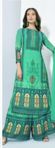
◆ D.No.8605 ◆