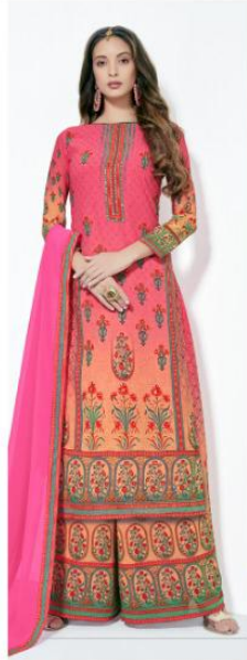
◆ D.No.8604 ◆