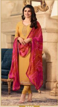
◆ 9962 ◆