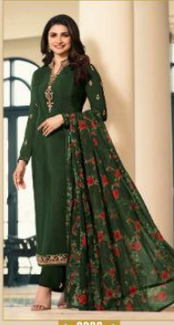
◆ 9966 ◆