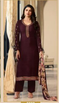
◆ 9969 ◆