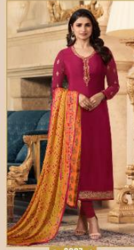
◆ 9967 ◆