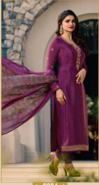
◆ 9964 ◆