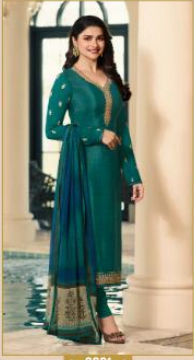
◆ 9961 ◆