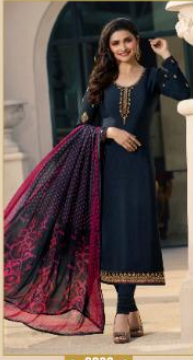
◆ 9963 ◆