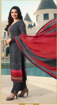
◆ 9965 ◆