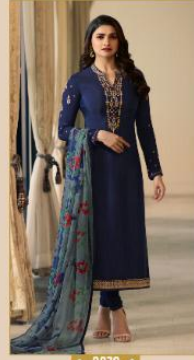
◆ 9970 ◆