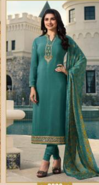
◆ 9968 ◆