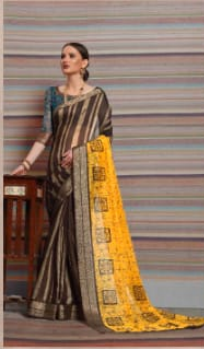
K - 2402