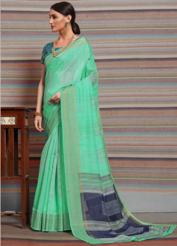
K - 2405