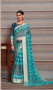
K - 2403