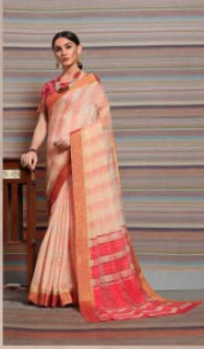
K - 2407