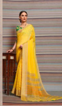
K - 2406