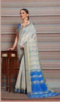
K - 2408