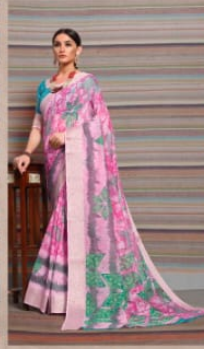
K - 2411