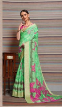
K - 2412