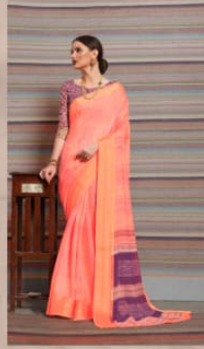
K - 2410