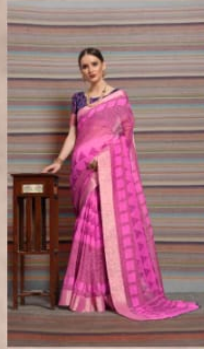
K - 2404