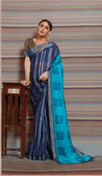
K - 2401