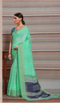
K - 2405