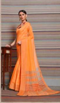
K - 2409