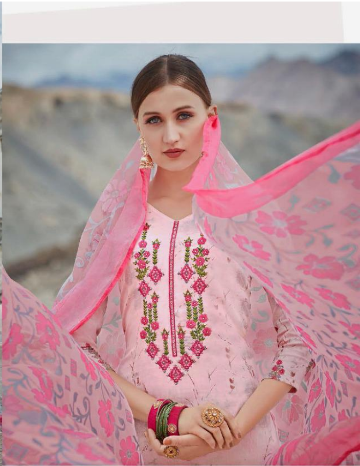
This Dress Will win Your Heart With its Simple yet Graceful appeal. D.NO. 104