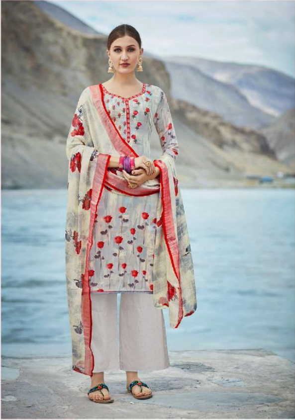
D.NO. 102 Memorizing Dress With Heavy Embroidered Worked