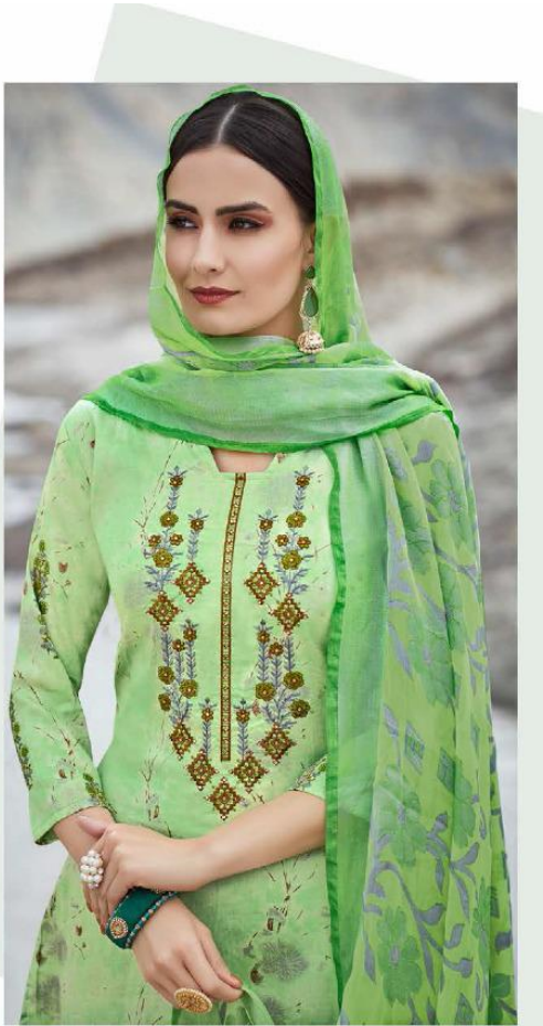
D.NO. 103 This Dress Will win Your Heart With its Simple yet Graceful appeal.