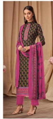
{ 8410 }