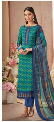
{ 8403 }