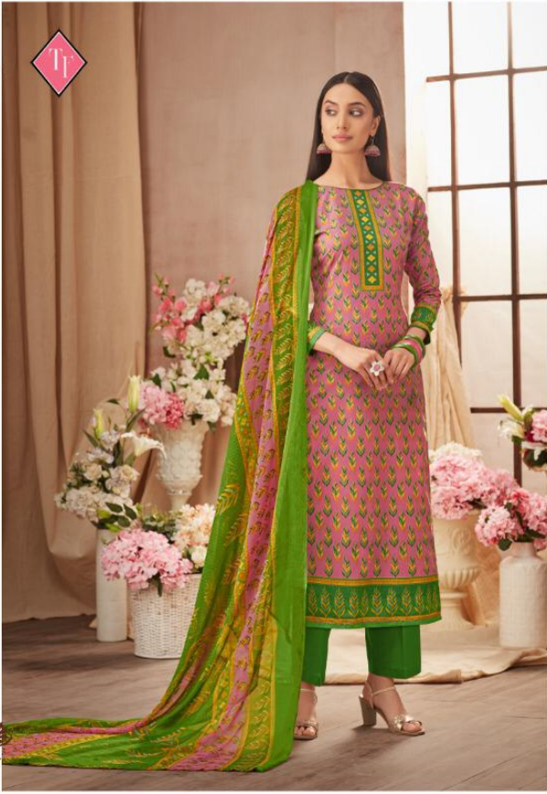
The key is to contrast two elements so you don't end up over doing the feminine quotient.