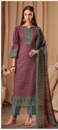
{ 8401 }