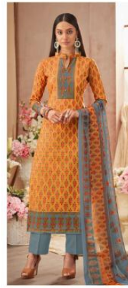
{ 8404 }