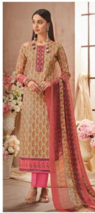
{ 8408 }