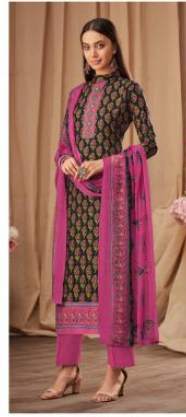
{ 8410 }