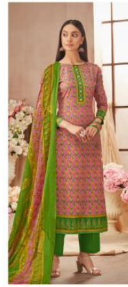
{ 8405 }