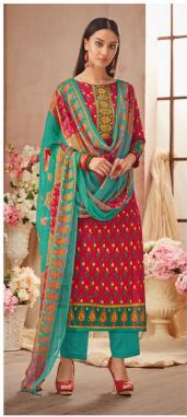
{ 8407 }