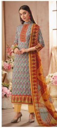
{ 8402 }