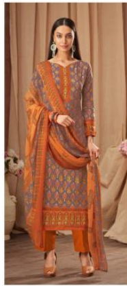
{ 8409 }