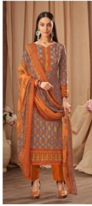
{ 8409 }