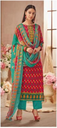
{ 8407 }