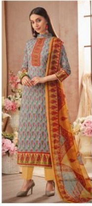
{ 8402 }