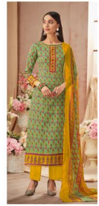
{ 8406 }