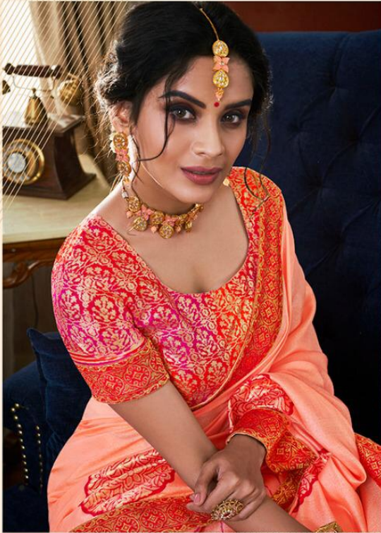
ELEGANT & CLASSIC DO FASHION AS THE ROMANCE DO 3860