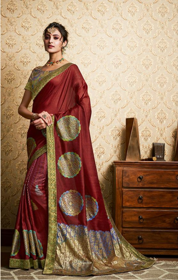
VIBRANT TONES TO GIVE ANY LOOK AN ADRENALINE RUSH. 3857