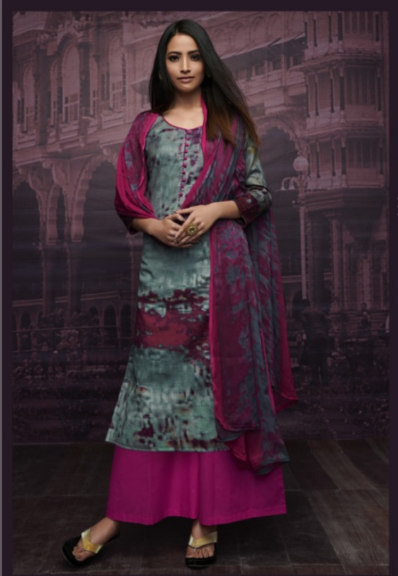
Beautiful naturally attaining urbanity with ethnicity in appareling with us.