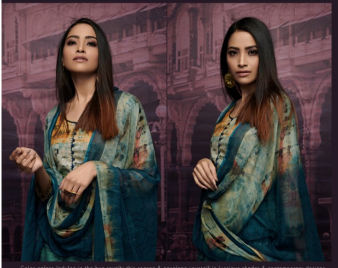
Color galore Indulge in the hue royalty this season & envelope yourself in luscious shades & contemporary designs.