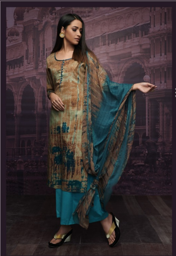
The common desire is to be able to create a statement without standing out as a different being.