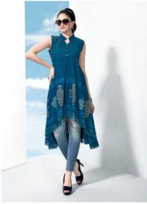
D.NO : 1001