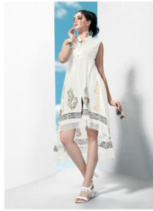
D.NO : 1007