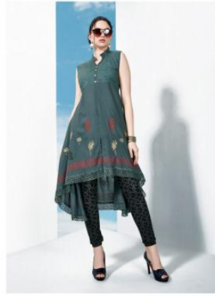
D.NO : 1003