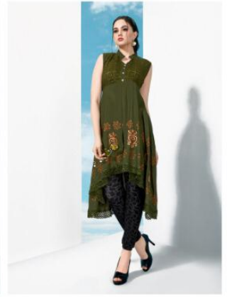
D.NO : 1004