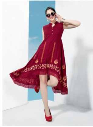
D.NO : 1002