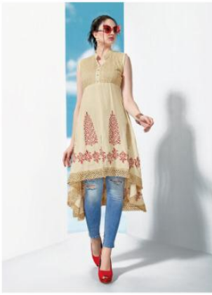
D.NO : 1005