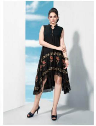
D.NO : 1008