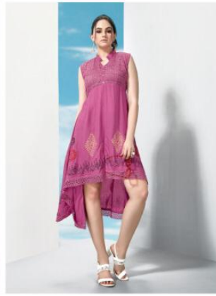
D.NO : 1006