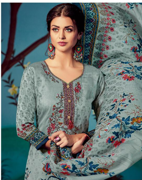
IT'S A BRILLIANTLY AFFORDABLE NEW LOOKS. NE EMBROIDERY PLACES. LOOK GRACEFUL. STYLISH. ELEGANT & SENSUOUS. 2004

Dressing well is a form of good manners.