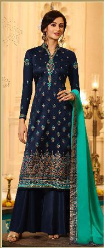
▲ 16301 ▲