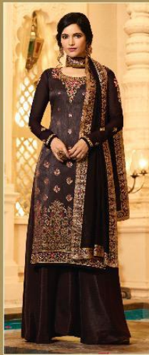
▲ 16302 ▲