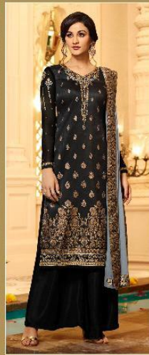
▲ 16303 ▲