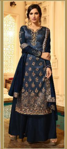
▲ 16306 ▲