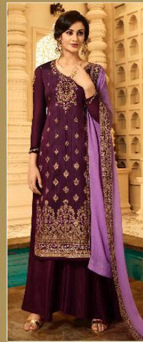
▲ 16305 ▲