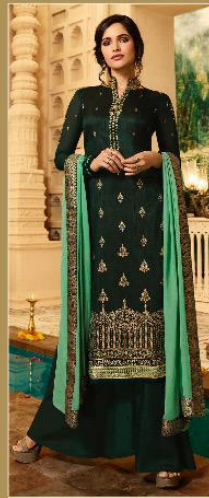
▲ 16304 ▲