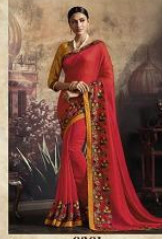
• 6361 •