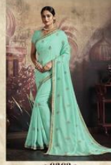
• 6362 •