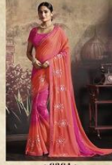
• 6364 •