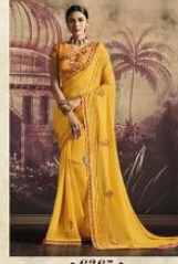
• 6365 •