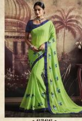
• 6366 •