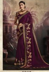
• 6363 •