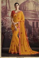
• 6350 •