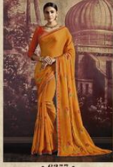
• 6357 •