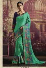
• 6360 •