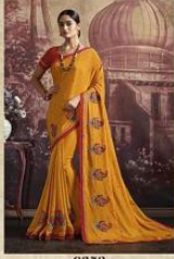
• 6352 •