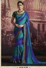
• 6358 •