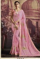
• 6355 •