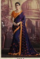
• 6354 •