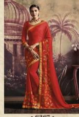
• 6367 •