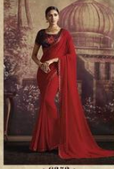
• 6353 •