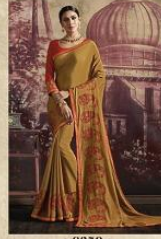
• 6359 •