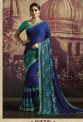
• 6356 •