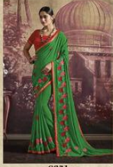
• 6351 •