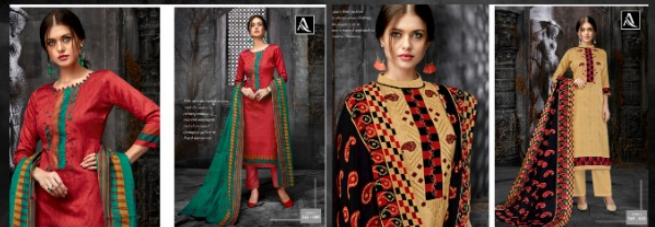
Code # 365 - 009