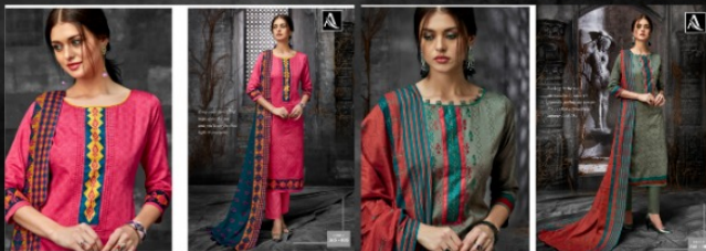
Code # 365 - 005