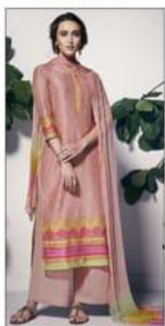
D.NO :- 7331