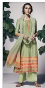
D.NO :- 7337