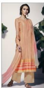
D.NO :- 7335