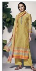
D.NO :- 7338