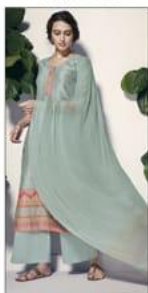
D.NO :- 7332