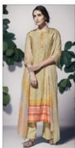
D.NO :- 7336