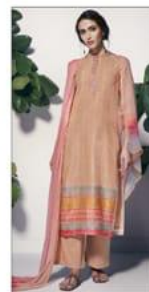
D.NO :- 7339