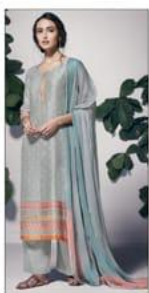
D.NO :- 7334