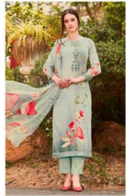
// 1024 //