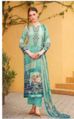
// 1020 //