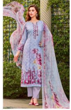
// 1022 //