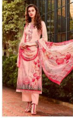
// 1018 //