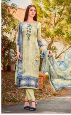
// 1017 //