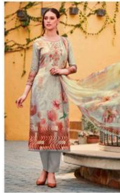
// 1023 //