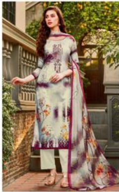
// 1019 //