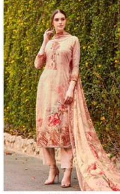
// 1021 //