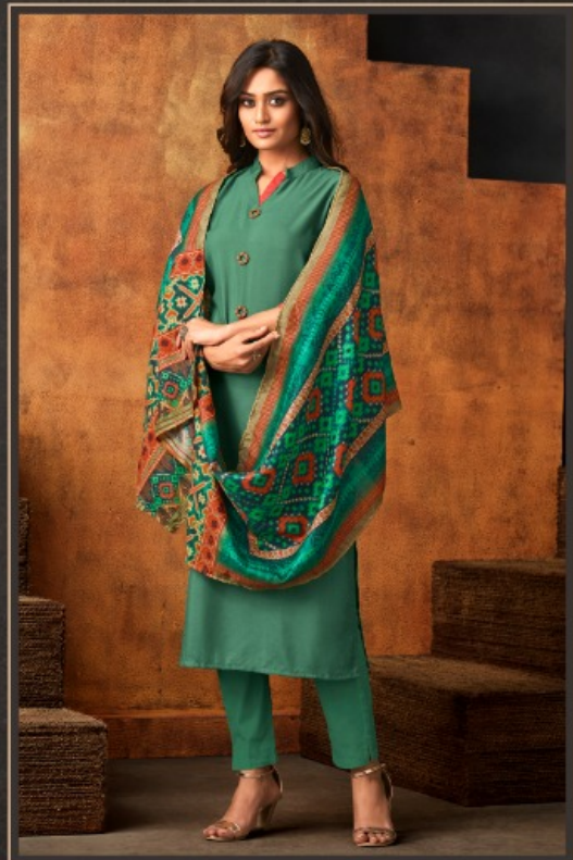
MONALISA - 1004