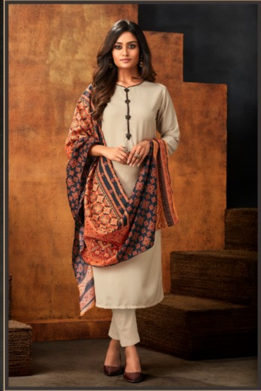
MONALISA - 1002