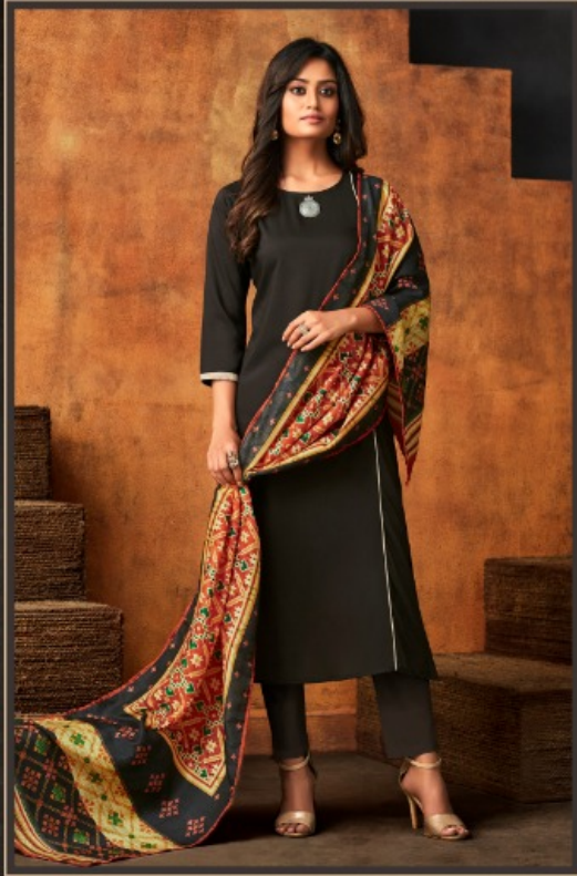
MONALISA - 1001