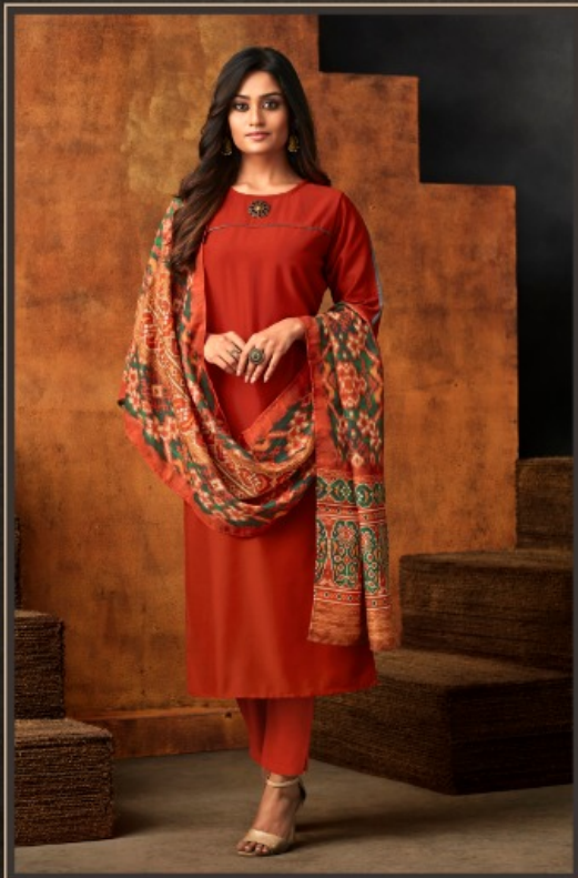
MONALISA - 1003