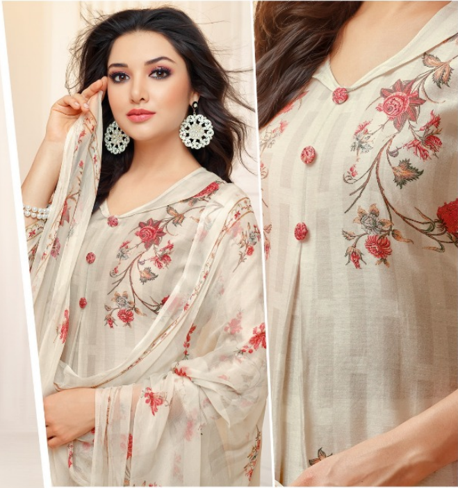
DRESS AS IF YOU'RE ALREADY FAMOUS.