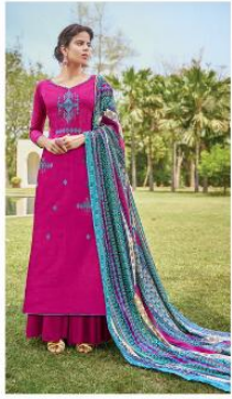
CODE # 9401