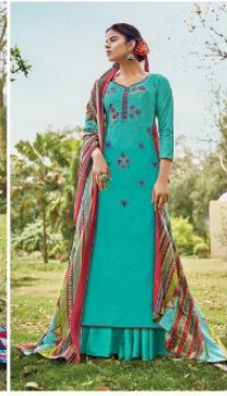
CODE # 9407