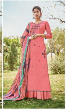
CODE # 9408