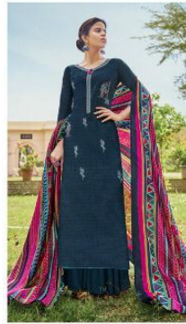
CODE # 9409