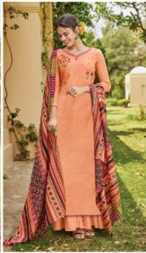
CODE # 9404