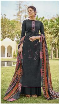
CODE # 9403