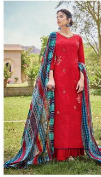
CODE # 9406