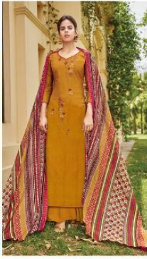
CODE # 9402