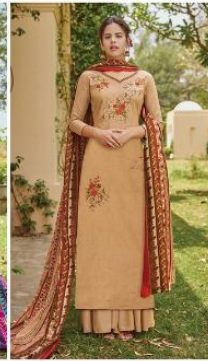
CODE # 9410