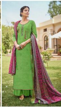
CODE # 9405