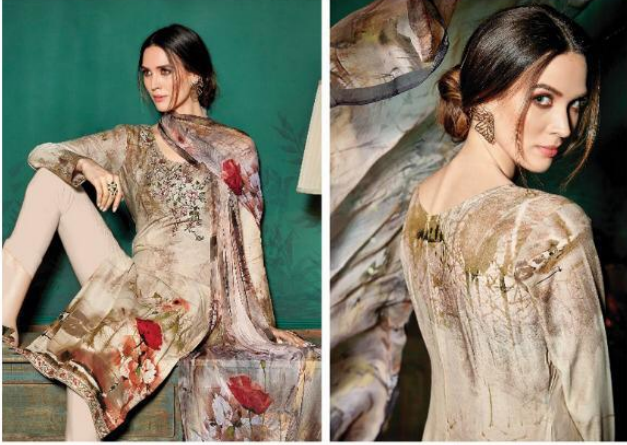
Combination of daring brown and red with creme to bring out the exclusively.