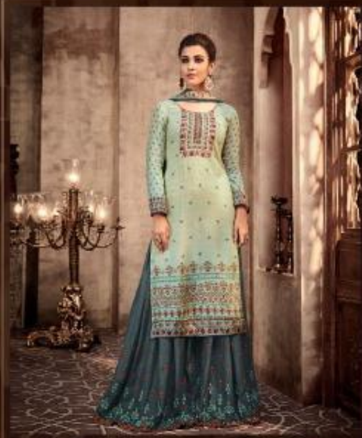
★ Glamour-68002 ★