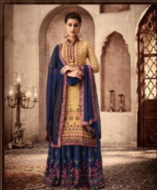
★ Glamour-68004 ★