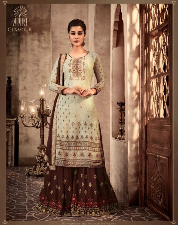
It's magnificent dress has lovely printing on it.