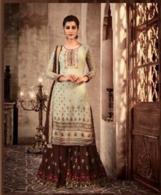
★ Glamour-68001 ★