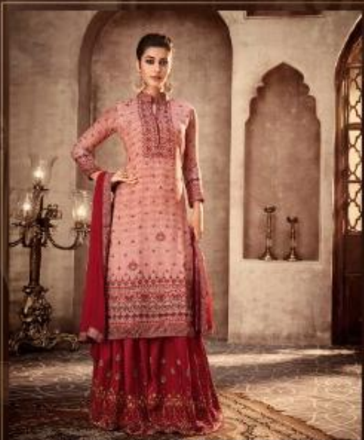
★ Glamour-68003 ★