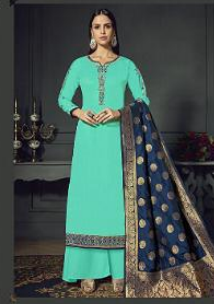
Code # 15405