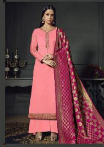
Code # 15701