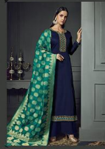
Code # 15702