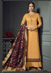
Code # 15704