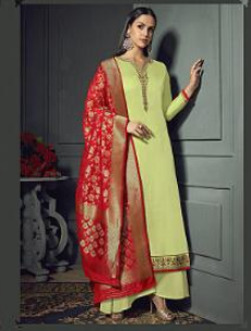
Code # 15706