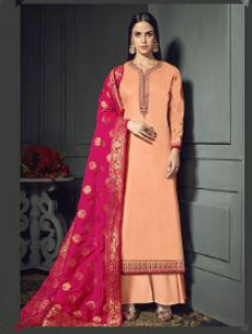
Code # 15703