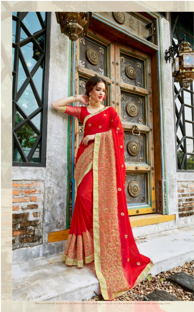
When you reach the heart of life you will find beauty in all things, and in the core that you find is beauty itself. Some things are here.