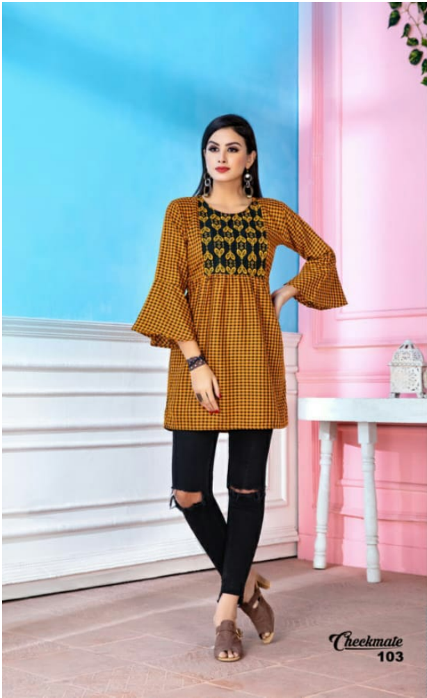
a whole new dimension in cool color season colored dress