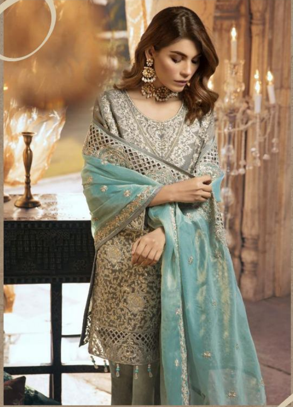
glamorous and elegant outfit ideal for the contemporary bride