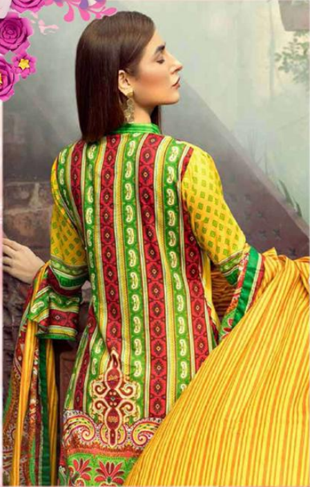
Design no. 6005