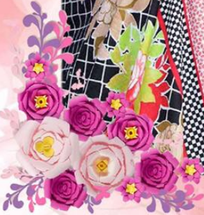
Design no. 6002