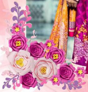
Design no. 6003