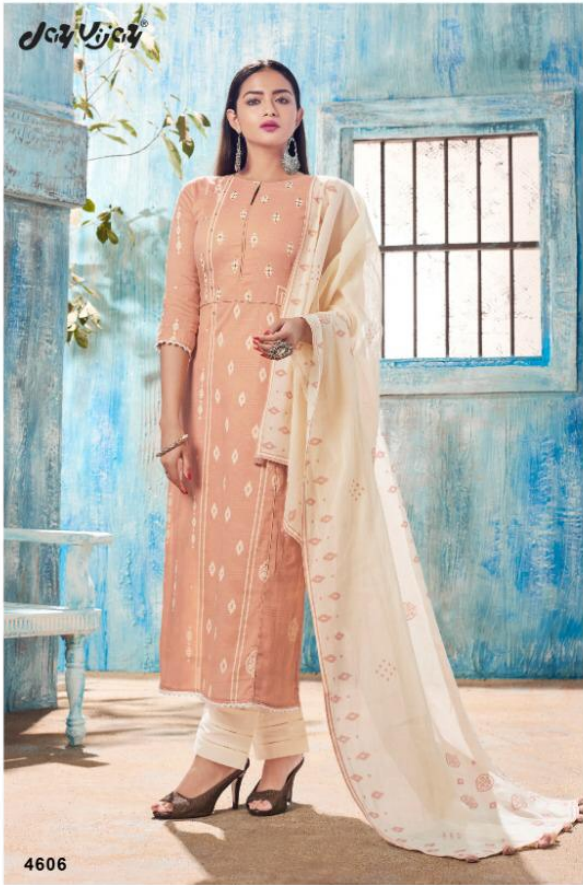
THE MOST INTERESTING SUMMER FASHION TRENDS.