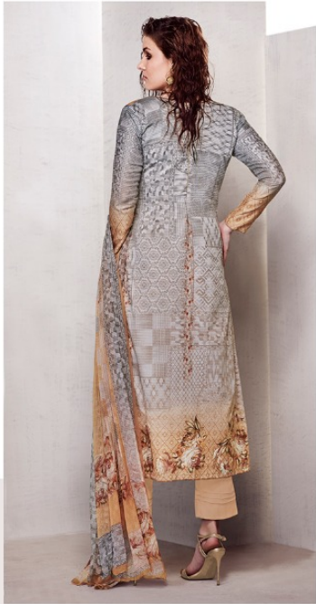
PARTY ON By the patterns & vibrant colors of poisonous yet beautiful creatures.