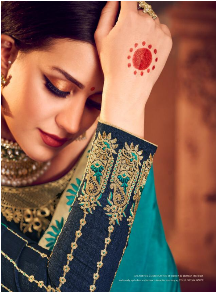
AN ARTFUL COMBINATION of comfort & glamour, this plush and trendy up holder collection is ideal for dressing up YOUR LIVING SPACE.