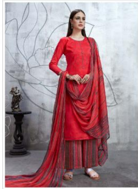
code no.114 - 006