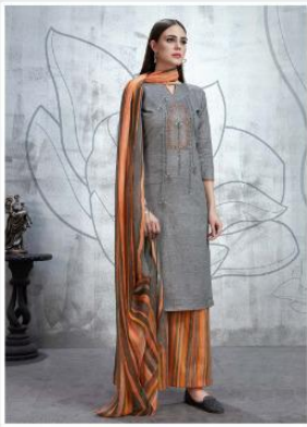
code no.114 - 005