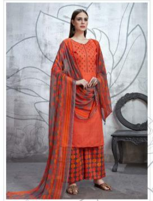
code no.114 - 008