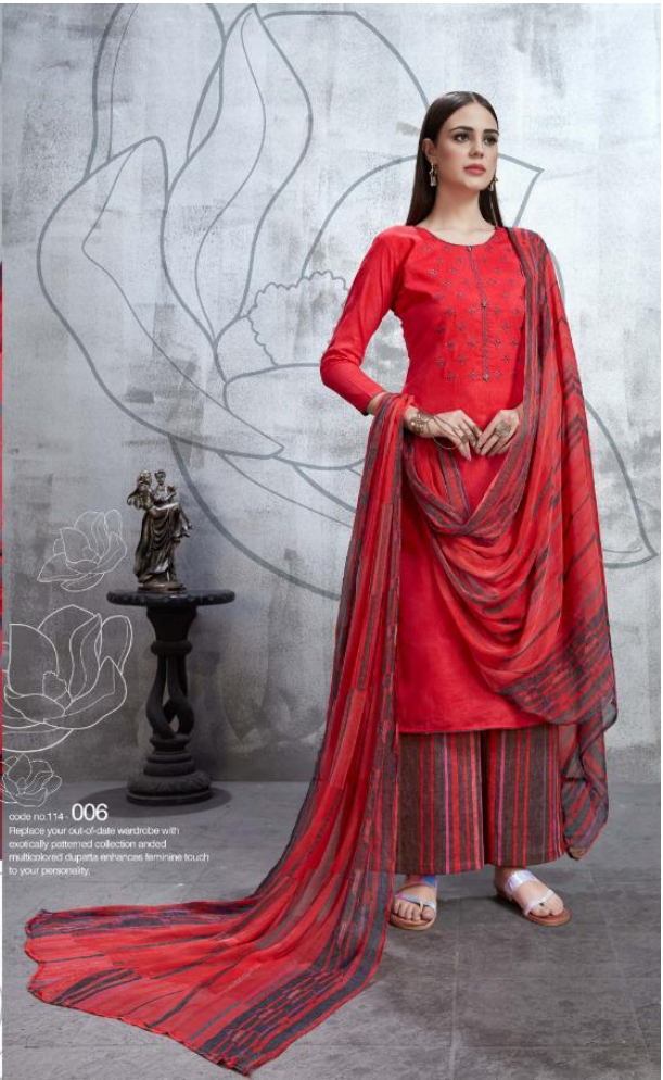
code no. 114 006 Replace your out-of-date wardrobe with exotically patterned collection and add multicolored dupatta enhances feminine touch to your personality.