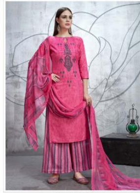
code no.114 - 003