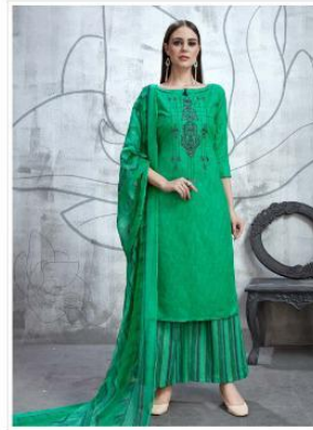
code no.114 - 007