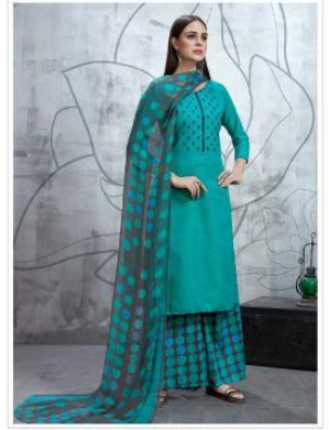
code no.114 - 004