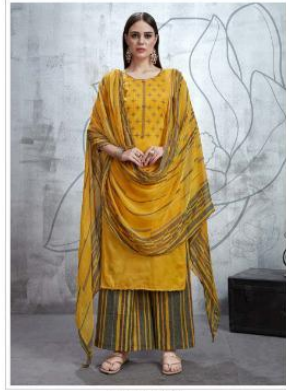
code no.114 - 002