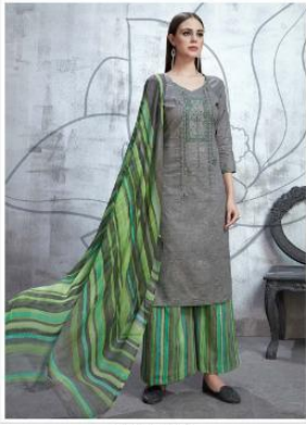
code no.114 - 001