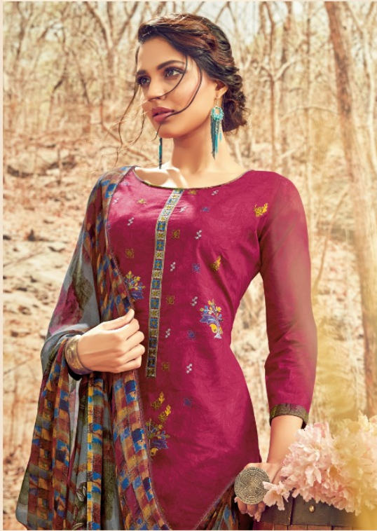
Beauty of style, harmony, grace & good Rhythem depend on style because style matters. You like your new exclusive look, it is a full of stylish.