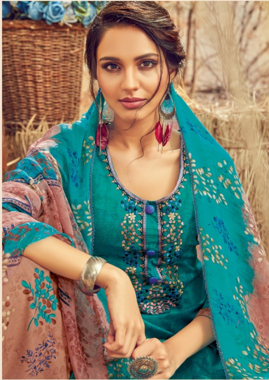
One's attire one wears speaks about her Personality. Indian woman is both traditional and modern. This collection is for her Be very Fashionable.