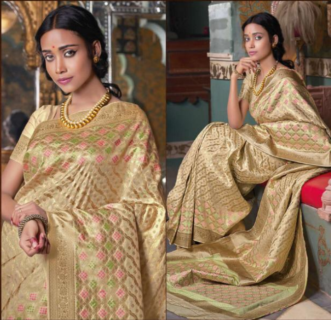
Mj fashion icons range from bubblegum pop princesses to grunge queens.