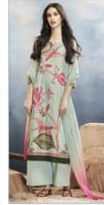
D.NO :- 7617