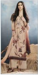
D.NO :- 7610