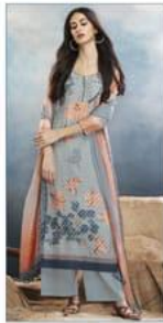
D.NO :- 7614