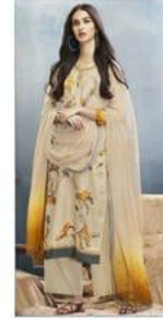
D.NO :- 7618