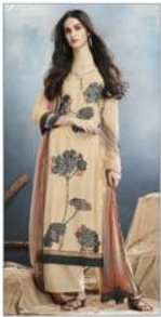
D.NO :- 7613