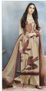
D.NO :- 7615