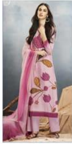
D.NO :- 7611