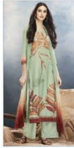
D.NO :- 7612