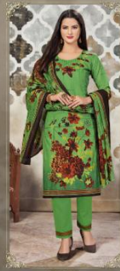
* 5009 *