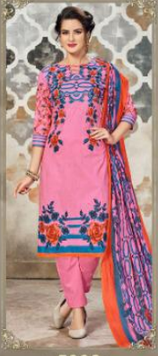
* 5002 *