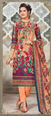
* 5005 *