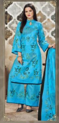
* 5008 *