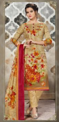
* 5010 *