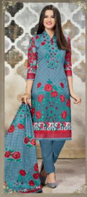
* 5003 *