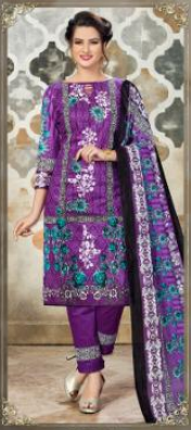
* 5004 *