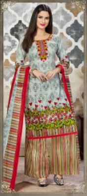
* 5001 *