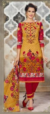
* 5006 *