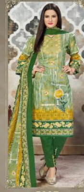
* 5007 *