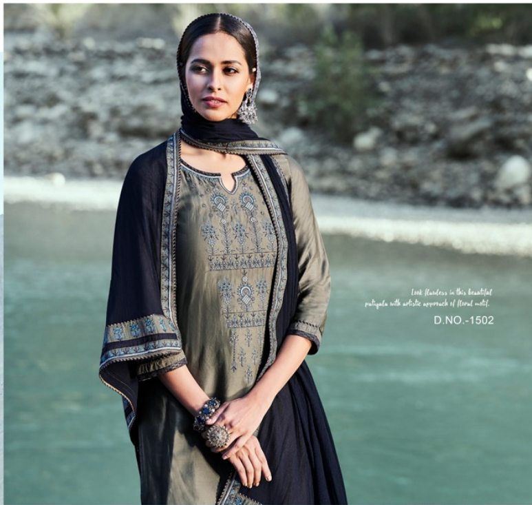
Look flawless in this beautiful patiyala with artistic approach of floral motif. D.NO.-1502