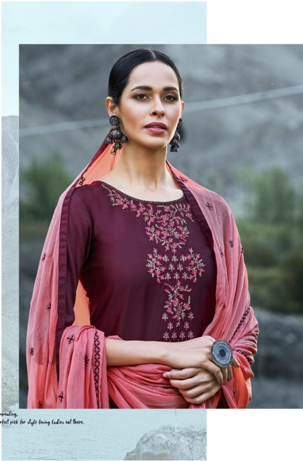
Vibrant and visually appealing, this pataka set is a perfect pick for style loving ladies out there.