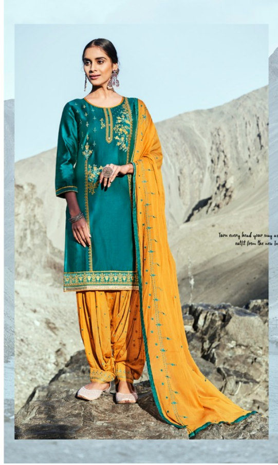
Turn every head your way as you stroll across in an outfit from the new Indian printful collection. D.NO.-1503