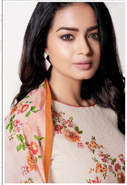
A BREATH TAKING ARRAY OF FINE DETAILING & INTRICATE DESIGN INSPIRED BY INDIAN CULTURE.