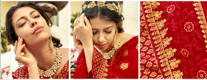
OFFERING A TRADITIONAL LOOK WITH A MODERN TWIST, THIS BEAUTIFUL SAREE STRIKES THE PERFECT BALANCE BETWEEN TIMELESS AND CONTEMPORARY. COVERED GRADIENT SPLASH OF YELLOW AND WHITE, THIS SAREE WILL BE AN APPROPRIATE OPTION FOR YOUR SOCIAL GATHERINGS.