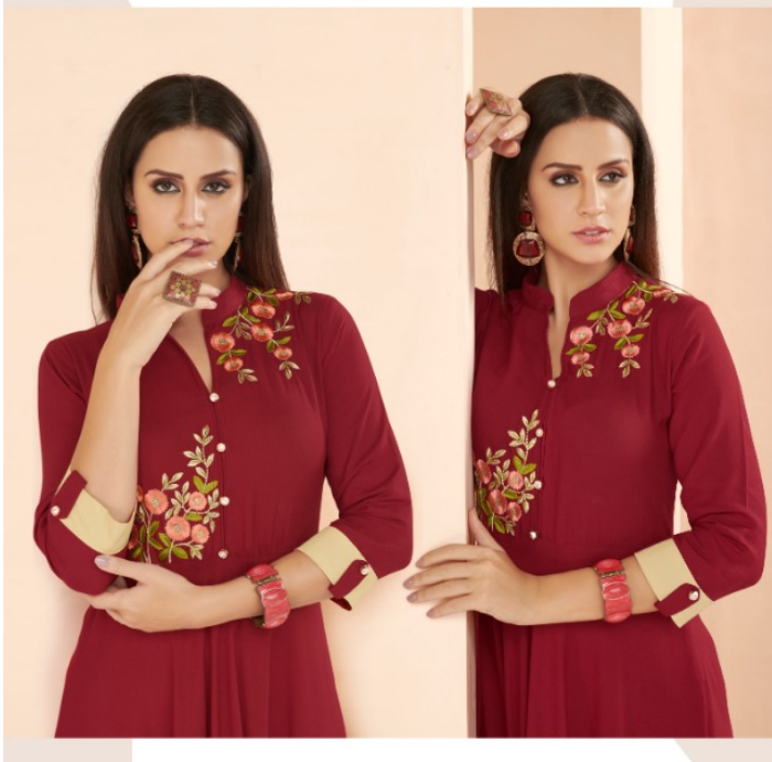
Embroideries to luxurious fabrics we have everything for you fashion indulgence, Embrace this season's womanly allure in sensuous