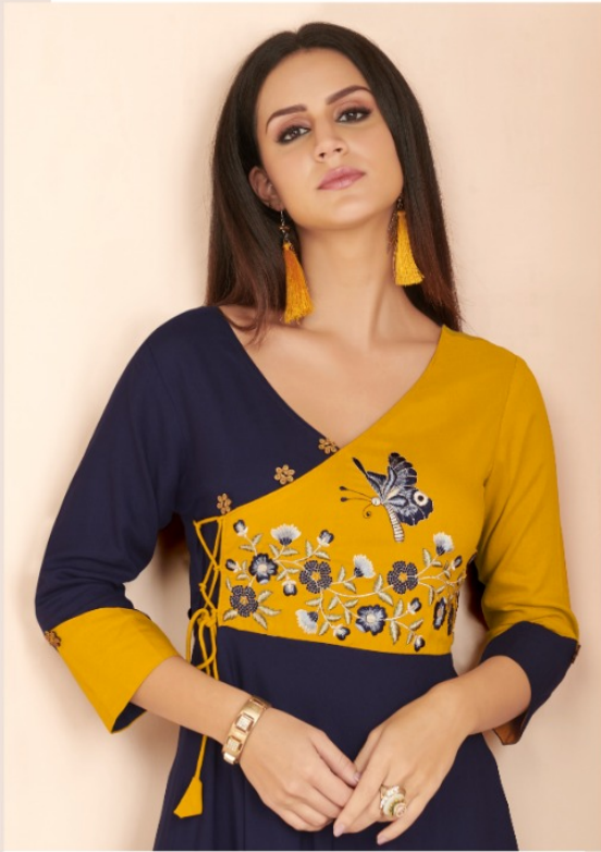
A scintillating plethora of timeless masterpieces inspired by beauty from Indian culture.